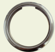
TRIM RING 6.25 INCH POSITION 4 PRODUCT CODE 1256-07