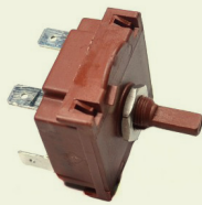
SELECTOR SWITCH 4 POSITION 6 PIN POSITION 6 PRODUCT CODE 10365