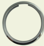
TRIM RING 180MM 8INCH POSITION 3 PRODUCT CODE 1255-42