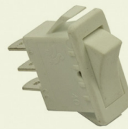
ROCKER SWITCH WHITE STANDARD POSITION 7 PRODUCT CODE ERM009