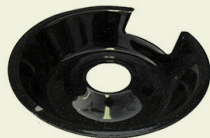
DRIP PAN - 6.25 INCH POSITION 2 PRODUCT CODE 1091-05