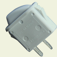
LIGHT SWITCH (ROCKER SWITCH) IN WHITE POSITION 8 PRODUCT CODE ERM095 SUIT BRANDS Simpson Westinghouse Models 0534001687