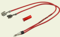
6MM NEON INDICATOR WITH LENS POSITION 9 PRODUCT CODE ERM263